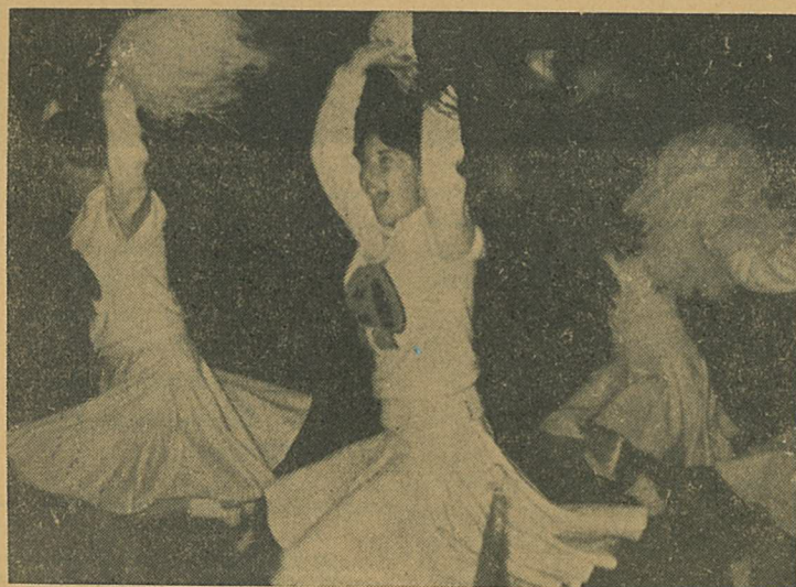
Holston's vivacious cheerleaders charge onto the field just ahead of the fighting Warriors.